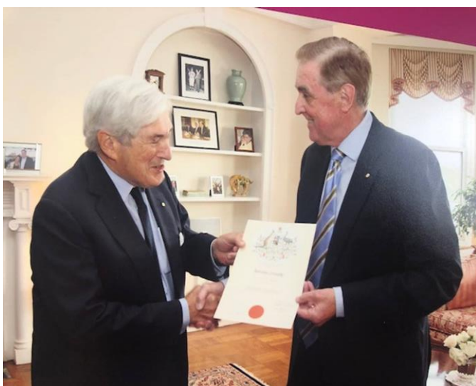
Jim’s restoration of Australian citizenship October 2010

Given his global citizenship outlook, it was no surprise in 1980 that Jim became a US citizen in order to enable his nomination to become President of the World Bank.